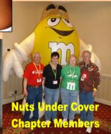
Nuts Under Cover Chapter Members