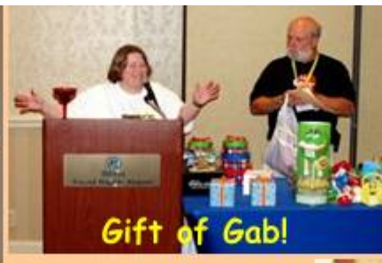
Gift of Gab!