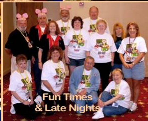
Fun Times & Late Nights