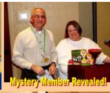
Mystery Member Revealed!