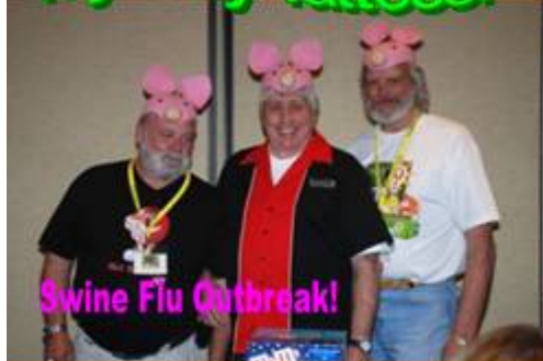
Swine Flu Outbreak!