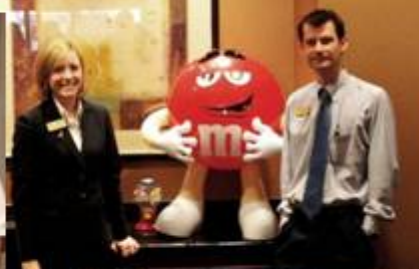
Friendly Hotel Staff